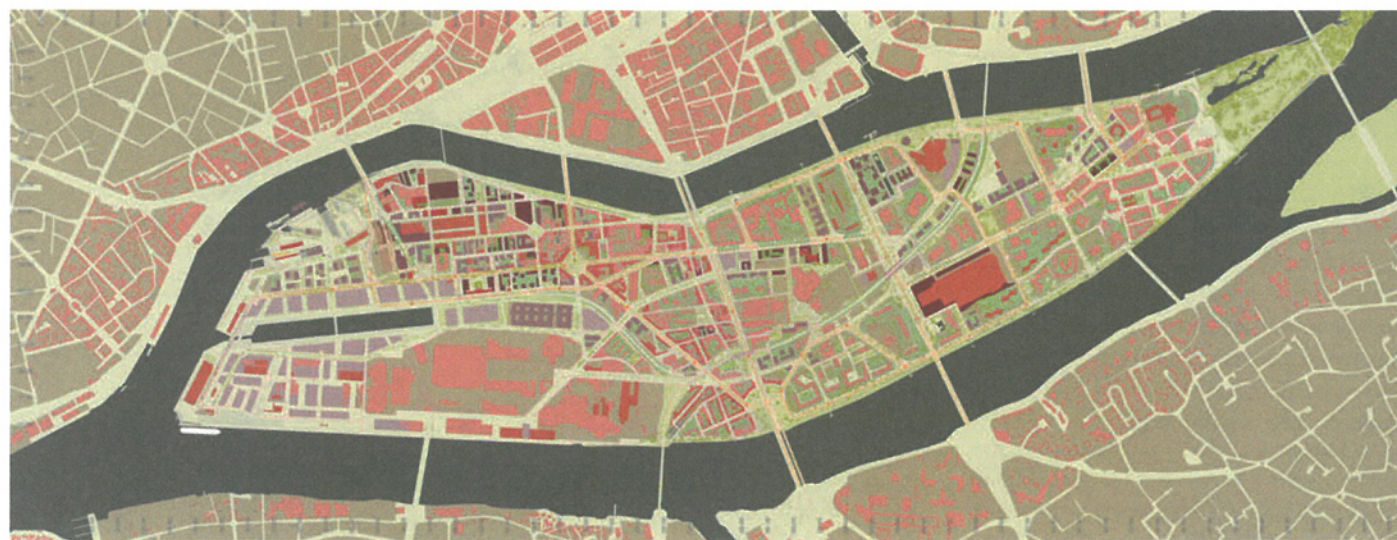
Plan & Guide Map (part two). The project overlaps the site. The public spaces layout slides into existing structures; new projects are thus made possible. Each project is dated, those being carried out are tinted dark brown, the lighter ones are hypothetical work.