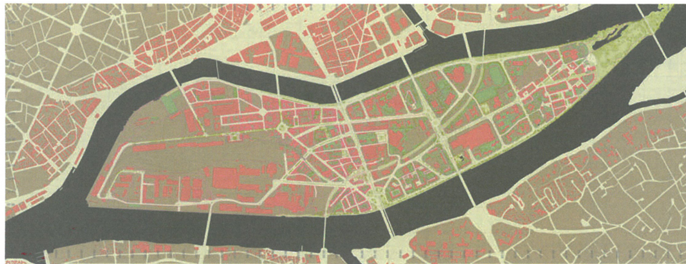
Plan & Guide Map (part one). "Learning from the site": The schedule of condition is not a sheet of constraints, but of resources. A sum of accumulated knowledge, available for undertaking projects. Everything is there.

Île de Nantes is located opposite the historic city of Nantes, surrounded by the Loire River and home to 13,000 inhabitants. It provides a unique opportunity to establish a new centrality for the city. To keep track of the actual evolution of the site as it develops, the intervention method focuses on the project in situ—public space as a concrete expression of the overall project—rather than to initiate an all-encompassing, abstract process. The Plan and Guide Map is a tool that serves as a prospective plan. It is being constantly updated in accordance with the actual progress of the project. A course of action based on the evolution of the island's identity helps identify turning points. The implementation of a principle of economy in terms of means, impact, and finance defines a development that subtly fits into the geography and the history of the site, without radical ruptures in the existing fabric. The construction coherence rules follow a principle of volume swaps on each block which lead to great architectural diversity. The project remains relative and open, and gives orientations for the whole site while respecting its evolution over time.